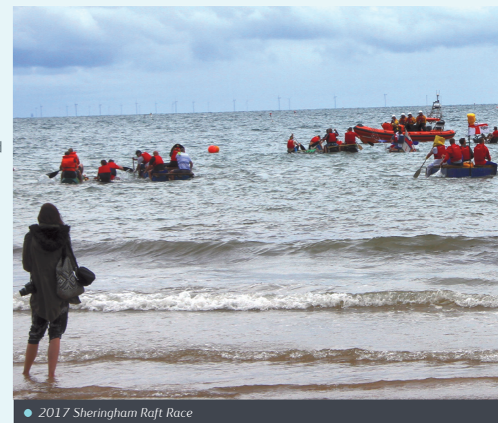
● 2017 Sheringham Raft Race

and further support for community events, projects and activities will be available during 2018 ●