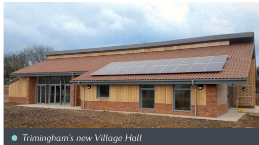
● Trimingham's new Village Hall

The coastal village of Trimingham in North Norfolk now has a new Village Hall to replace the small Pilgrim Shelter which has served as the village hall since 1935.